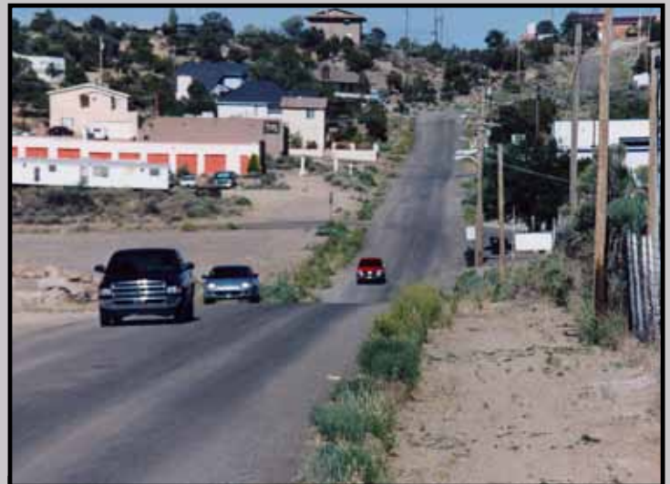
Asphalt Millings (RAP) Stabilized with EMC SQUARED® Stabilizer (utilized for five years as a street surface)

The aggregate material from the street surfacing project was sampled and shipped to the Texas Transportation Institute