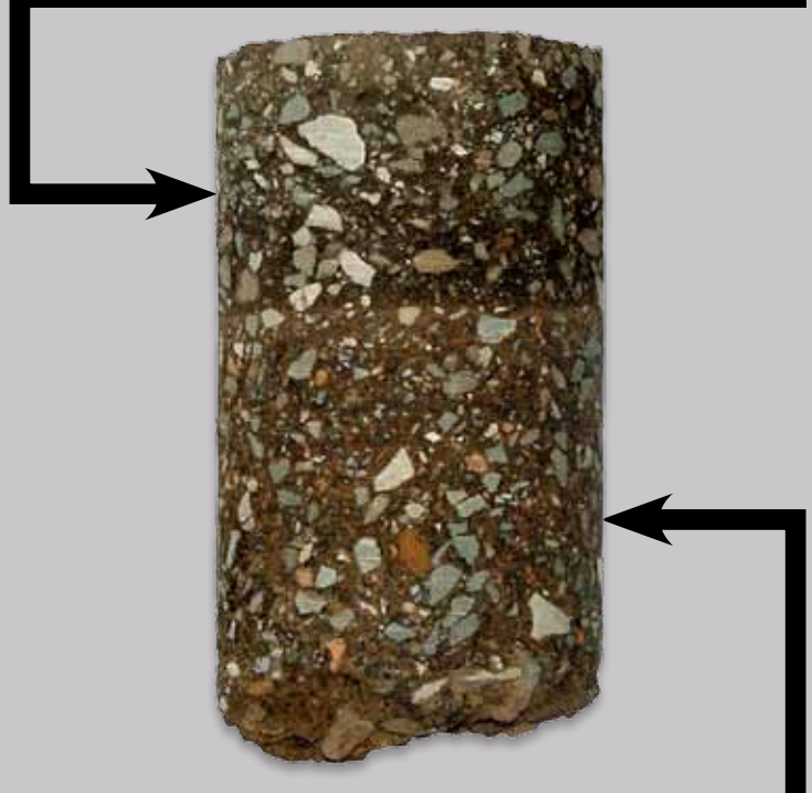
Aggregate Stabilized with EMC SQUARED® Stabilizer (utilized for two years as a street surface)