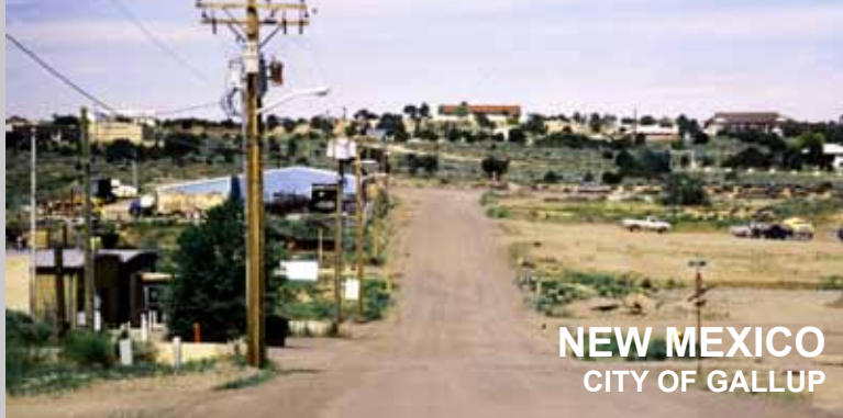
NEW MEXICO CITY OF GALLUP