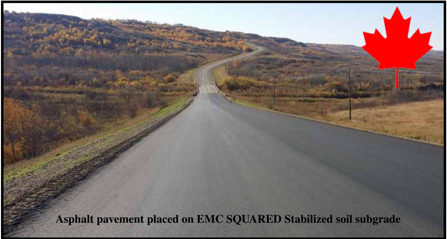
Asphalt pavement placed on EMC SQUARED Stabilized soil subgrade